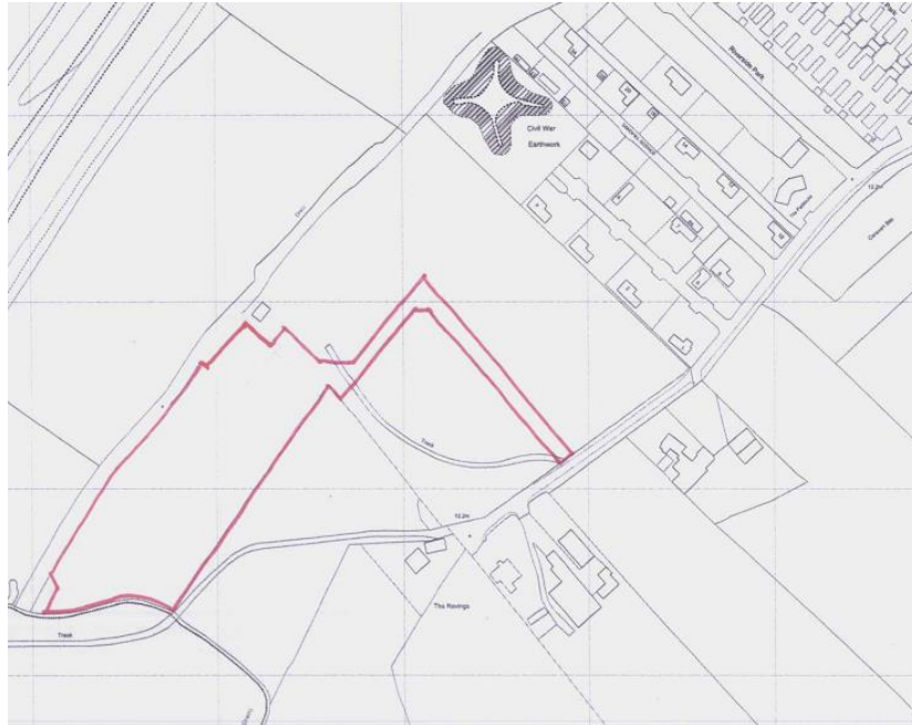
Original site location plan submitted under 12/00562/FUL

runs from the Great North Road, on the northwest side of the River Trent and which leads to a dead end. The site, known as Green Park, is accessed from Tolney Lane, via an access road, which runs through an existing neighbouring gypsy and traveller site to the north-east. The road has been extended to the south-west to serve this site. Green Park represents the final gypsy and traveller site at the south-western end of Tolney Lane.