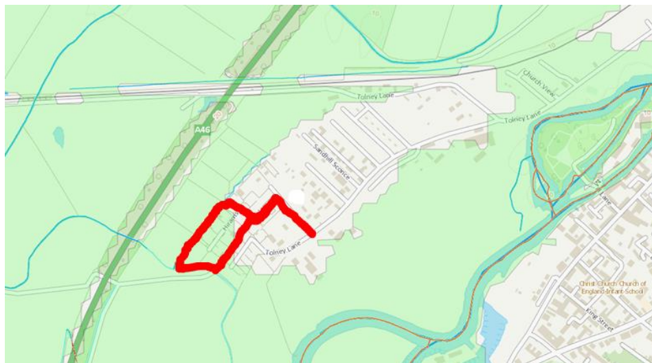
Site edged in red, extent of Flood Zone 3b shown in green