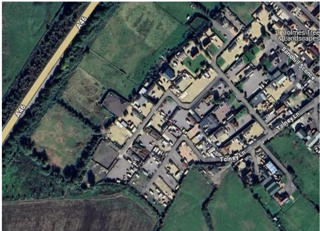
Aerial view of the application site